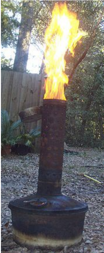
Oil-burning smudge pot, used to protect temperature-sensitive citrus groves from freezing temperatures.